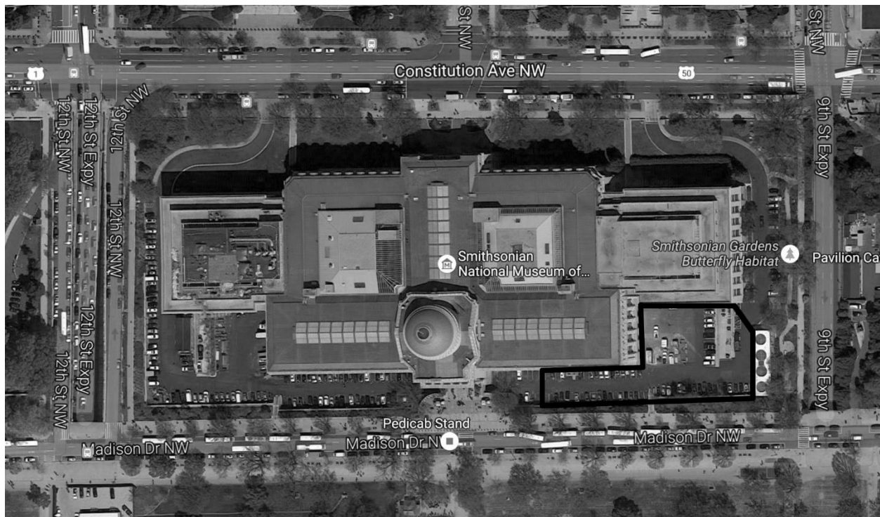
Load limitation area of the East Parking Lot demarcated with black line.